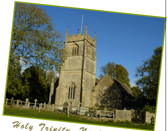
Holy Trinity, Newton St Loe